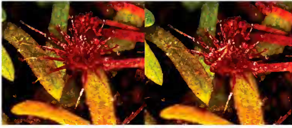
Figure 9: Two catapults of Drosera occidentalis moved synchronically.

were able to respond in 400 milliseconds ( D. glanduligera ) up to two seconds, and moved significantly faster. We never found glue-tentacles that bend in fractions of a second. Our observations revealed two distinct and independent acting capture mechanisms in one trap. One is fundamental, mucilage-based and relatively slow; the second appears derived, mucus-free and based on rapid movement. This is of interest regard-